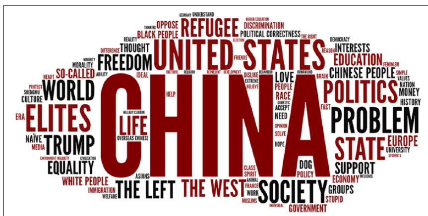
Figure 3. Word cloud of the corpus (excluding ‘white left’).

exists but argue that their contribution should be acknowledged despite their flaws. The topics, ideologies and strategies of argumentation in Chinese criticisms of the ‘white left’ overlap to a large degree with those of right-wing populist discourses in the West (Krämer, 2017; Wodak, 2015). 7 The most salient issue categories are immigration/refugees, race/racial relations and Islam/Muslims. Regarding the economy and social welfare, critics of baizuo either attack redistributive economic policies and the welfare state or assert that immigrants and minority ethnic groups (bar Chinese immigrants) are welfare dependants. Other topics deal with postmaterialist values such as feminism, environmentalism and LGBT rights (see Figures 2 and 3). While the anti-elitist rhetoric is highly visible, we consider the core ideological features to be racial nationalism (taking the form of racism, nativism and Islamophobia) and realist authoritarianism (associated with authoritarianism, realpolitik and social Darwinism).